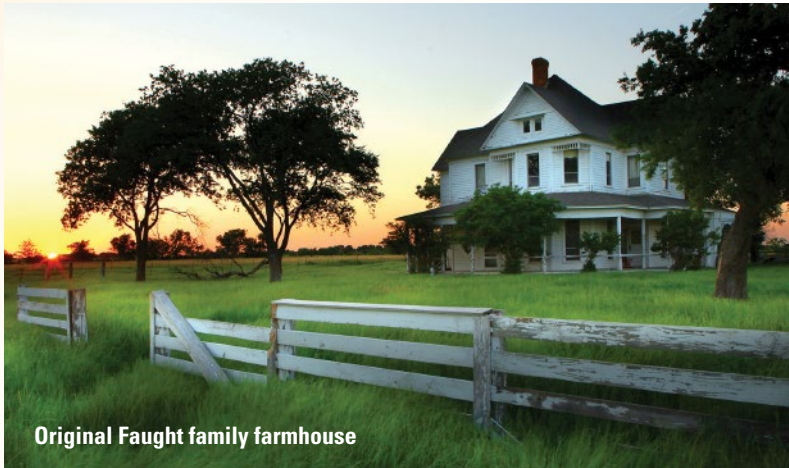
Original Faught family farmhouse