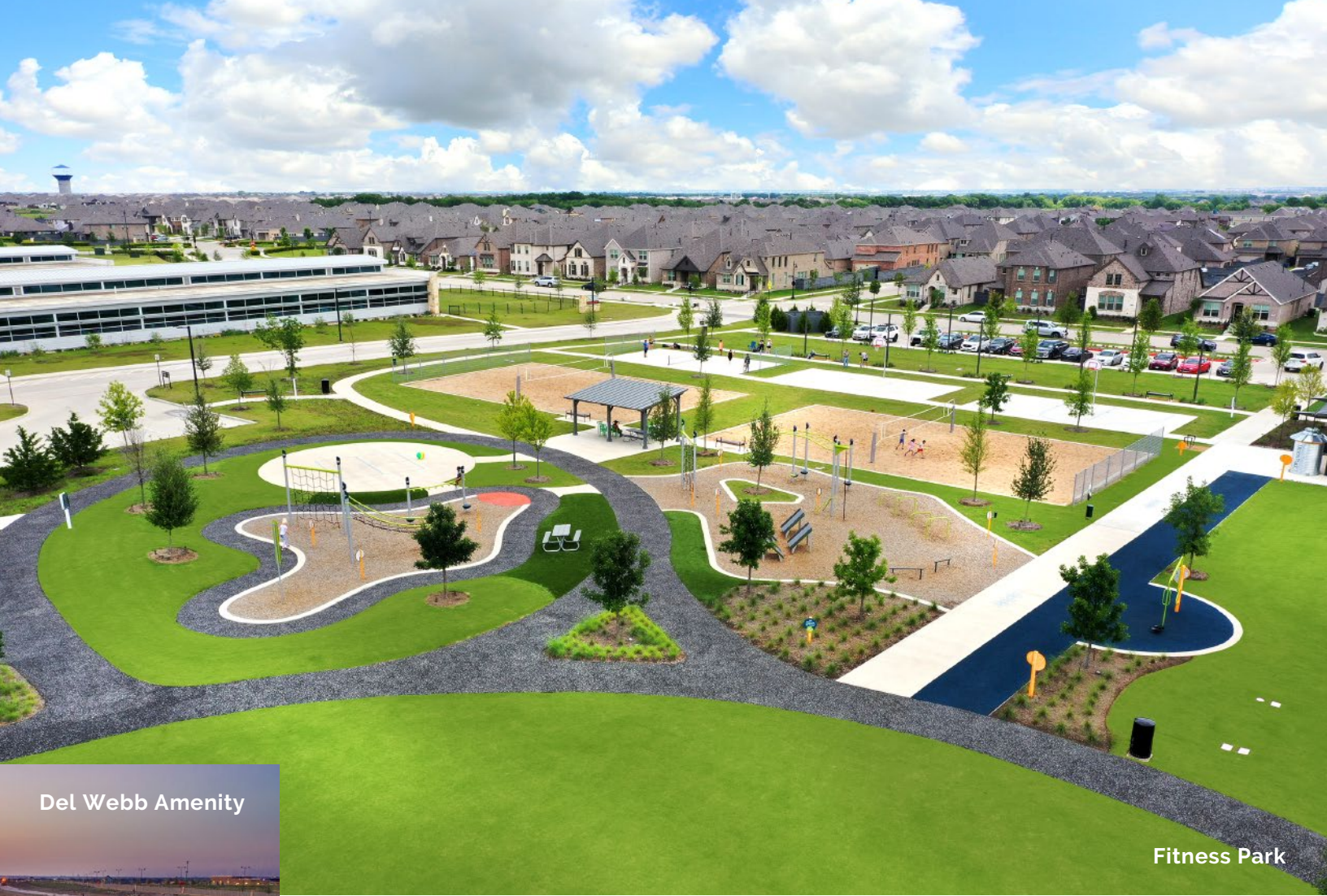
Del Webb Amenity