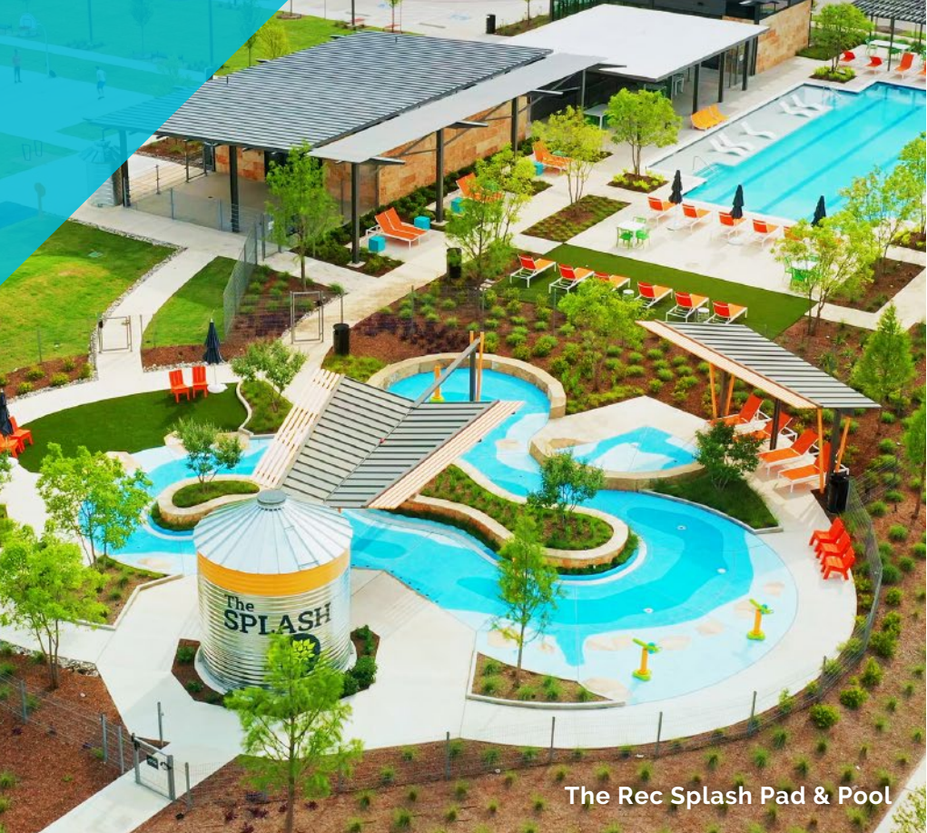
The Rec Splash Pad & Pool